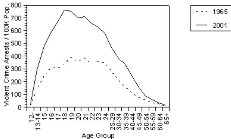
Figure 2. Violent Crime Rates By Age, 1965 and 2001